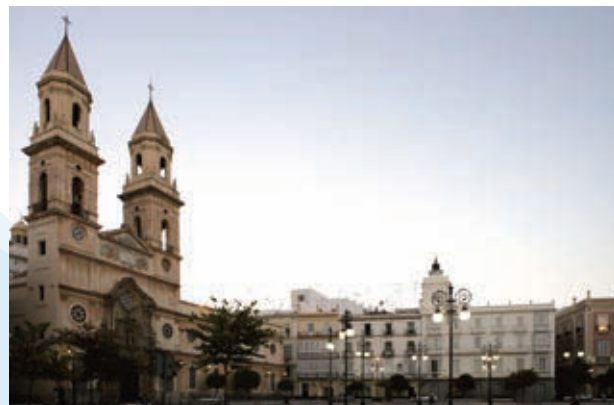
San Antonio Square