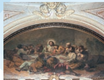
"The Holy Supper" by Goya