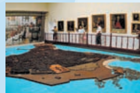
Scale model of the city