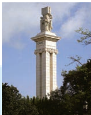
Route 4. Constitution of Cadiz