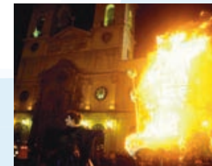
Burning of God Momo

Cadiz has a calendar full of attractive events, but two of them stand out; Carnival and Holy Week. Corpus Christi and Saint John's celebrations are exceptionally beautiful too.