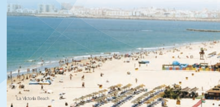
La Victoria Beach