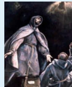
"Ecstasy of Saint Francis" by El Greco