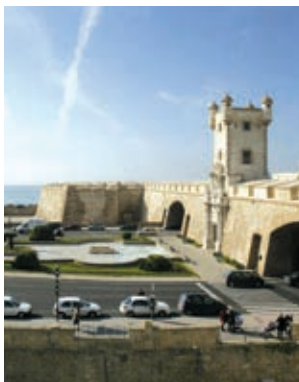
Route 1. Medieval District and Puerta de Tierra (Land Gate)

We invite you to get to know Cadiz through different routes: medieval district, castles and bastions, history of the cargadores de Indias (freighters to the Indies) and the origins of Spanish Constitutionalism.