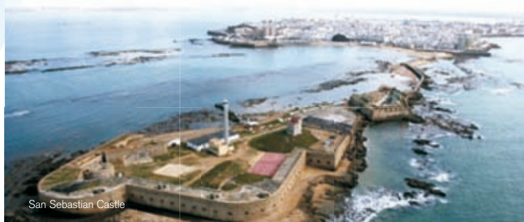
San Sebastian Castle

And if you want to enjoy beautiful landscapes we recommend you a daylight walk along the city walls or an evening walk to enjoy the magnificent sunset at La Caleta beach.