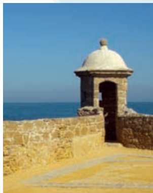
Route 2. Castles and Bastions